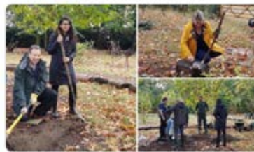
West Ham Park @WestHamParkE7 - Sep 24, 2019 On #CityGivingDay we welcome our own colleagues who are giving their time and making a huge difference in our Wildlife Garden.

Register before 30 June 2020 to be entered into a draw for the opportunity of a visit by the Lord Mayor, Lady Mayoress, Sheriffs or Aldermen on City Giving Day.