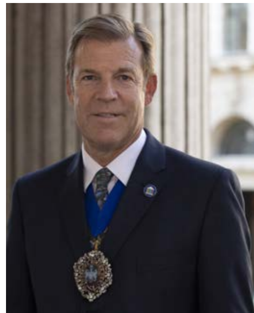
Alderman William Russell The Rt Hon The Lord Mayor of the City of London