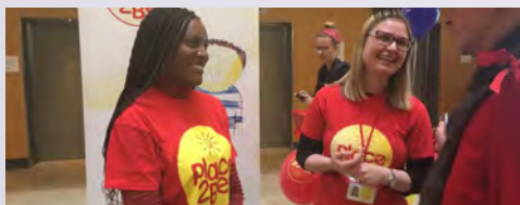
PROMOTE & CELEBRATE YOUR CHARITY/ COMMUNITY WORK